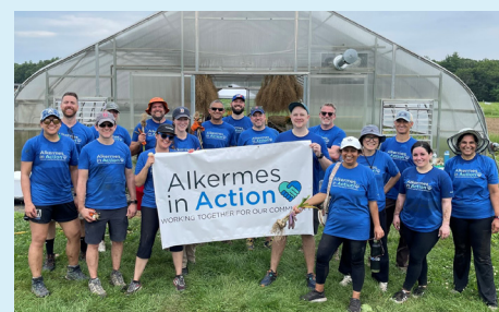
Alkermes employees participated in Alkermes in Action volunteer events